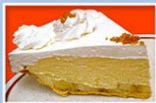
Banana Cream Pie